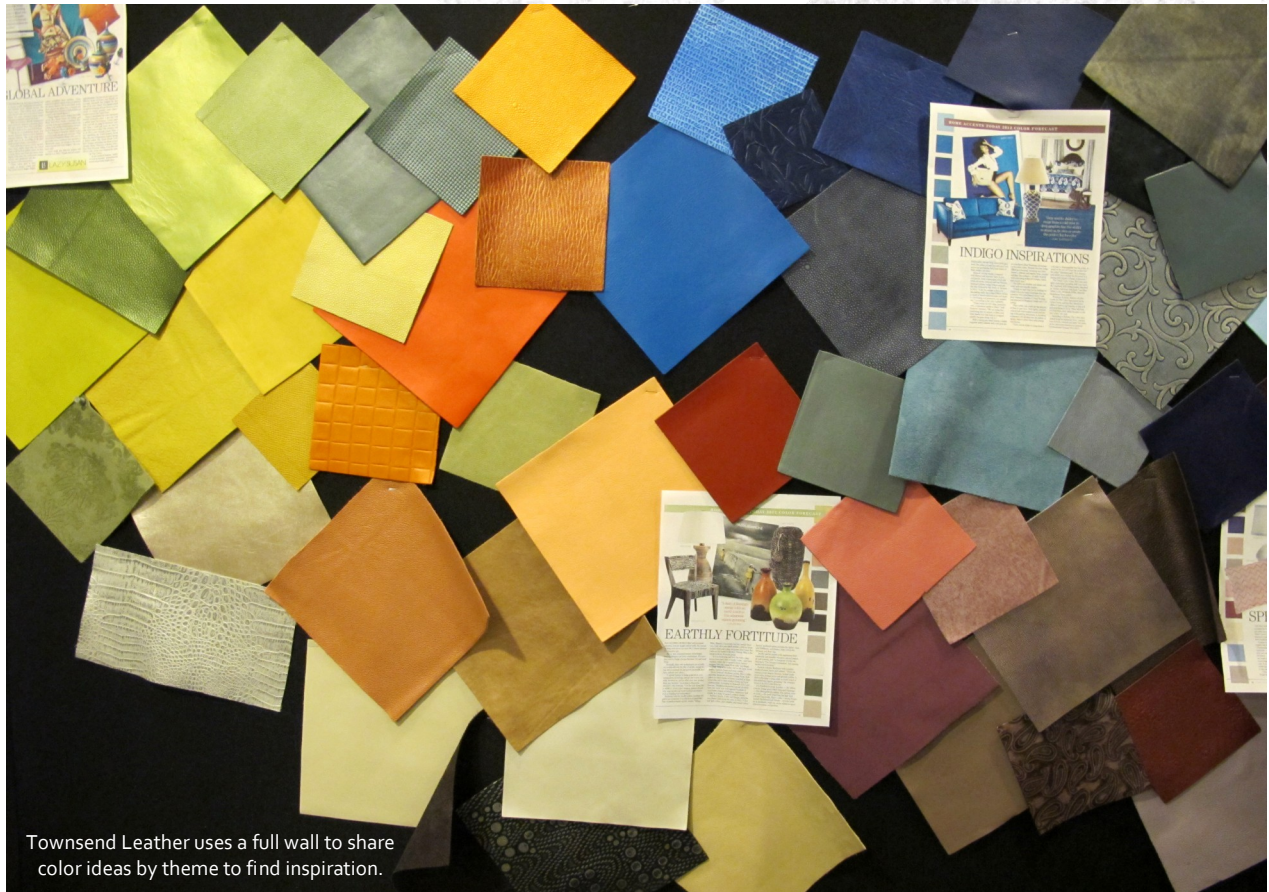
Townsend Leather uses a full wall to share color ideas by theme to find inspiration.

Another inspiration, probably our most often-referred to, is: you, our customer! Working with designers in various industries around the world, we are fortunate to have the opportunity to see in real-time what colors and finishes are being asked for and our craftspeople then translate these trends into strike-off samples. Producing thousands of strike-offs a year that we catalog, we see very quickly what colors are trending. The picture shown above is of our new color board in our Design Center. Based around color themes categorized by Home Accent Today's 2012 Color Forecast, we pulled samples from recent strike-off requests and grouped them according to the themes of Global Adventure, Indigo Inspirations, Earthly Fortitude, and Speaking Vintage.