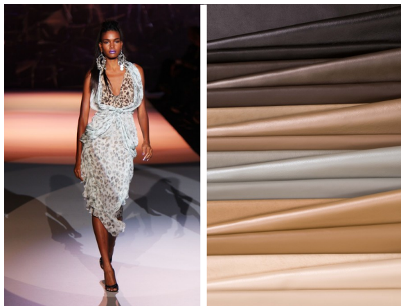
Using fashion trends as more color inspiration, Townsend is able to be ahead of the game on current color ideas (pictured on left is a design from Zac Posen’s Spring 2009 Collection, on the right is Townsend’s Cosmopolitan Collection)