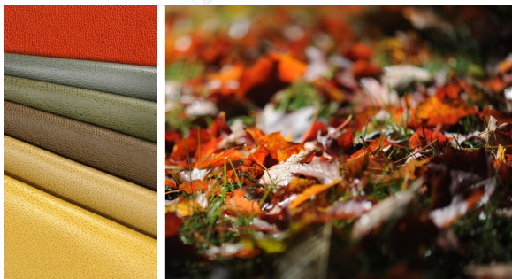
Townsend Leather uses nature as an inspiration for color; this Adirondack foliage helped inspire the Perfectly Pebbled Collection

As a company making a natural product and located at the foothills of the beautiful Adirondack Mountains in Upstate New York, we are often inspired first and foremost by nature. Many of our leather collections, such as our new earth-tone-inspired Perfectly Pebbled embossed cowhide, have been pulled from colors found in and around the scenery and wildlife that surrounds us. Nature also inspires texture for us; often texture and color must go hand in hand. The beautiful hand-rubbing of our Antique Glaze Lambskin colors, for instance, highlights and accentuates the natural markings and organic color palette of this leather.