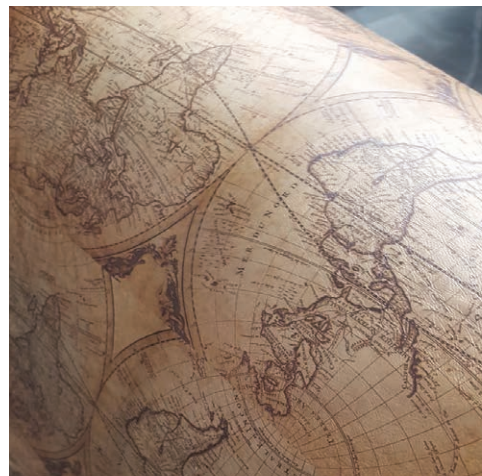
SEE ARTWORK REQUIREMENTS ON BACKSIDE