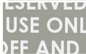
FINE PRINT IS EASILY PRINTED