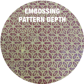
EMBOSSING PATTERN DEPTH