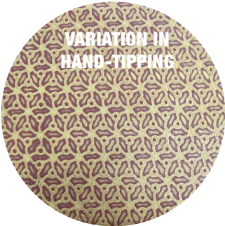
VARIATION IN HAND-TIPPING