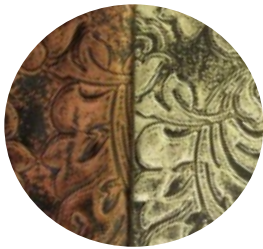
LA SCALA DAMASK