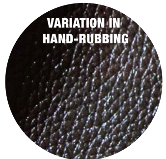
VARIATION IN HAND-RUBBING